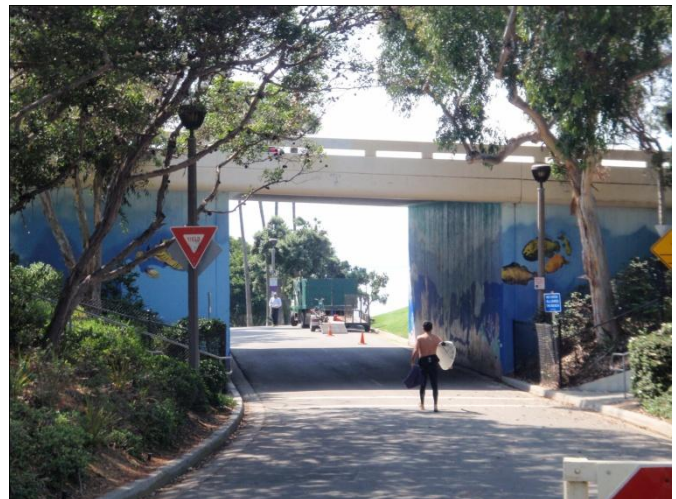
Salt Creek ramp from lot off of Ritz Carlton Drive