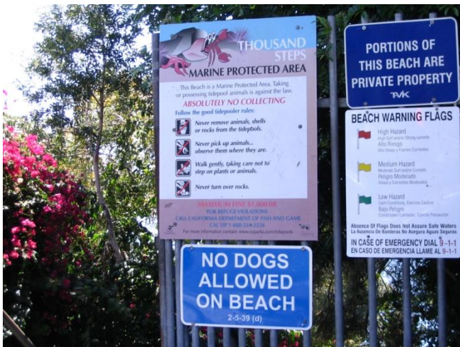
Thousand steps access, 9 th street off of PCH