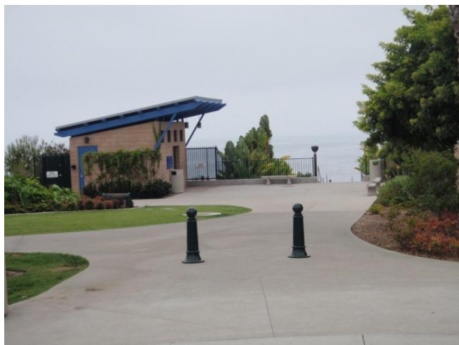
Strands north access with funicular off of Selva Road