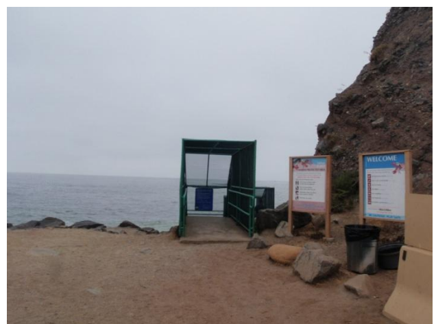
Harbor beach access behind Ocean Institute at end of Dana Point Harbor Drive