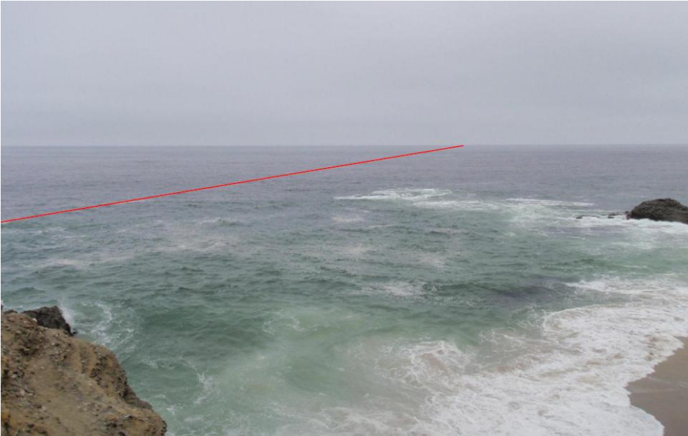
Photo taken from private staircase at southern side of Tablerock Beach, at point off of Seacliff Drive.