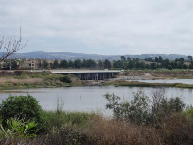
Photo taken of bridge at Jamboree from the north side. Trail accessed at corner of Bayview Way and Bayview Place, off of Jamboree.