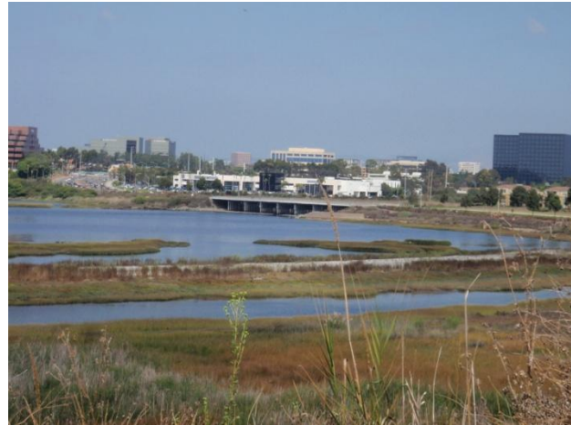
Photo taken from south side, at the end of multi use trail /one way road (Back Bay Drive) off of Eastbluff. Fishing allowed by bridge.