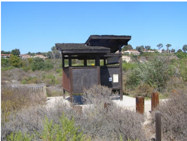
Big Canyon kiosk off of Back Bay Drive. Access to fishing area.