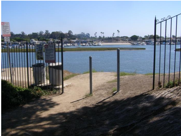
Castaways access looking across at Newport Dunes. Access to fishing area.