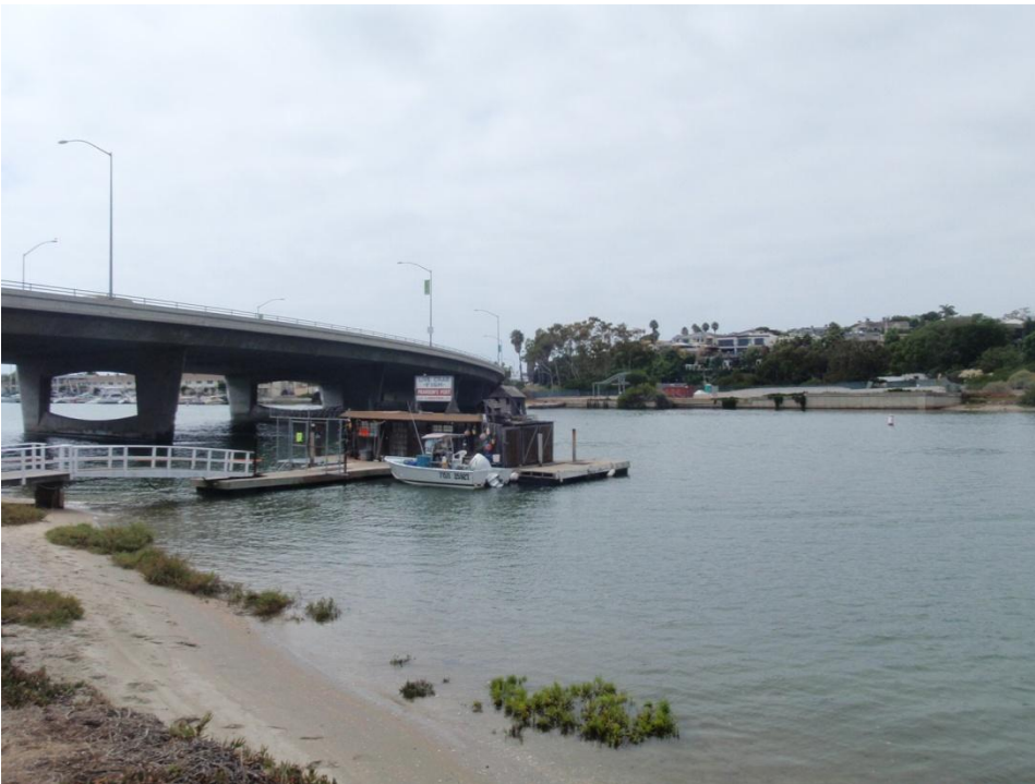
Photo taken from the end of Bayside Way, at Bayside Village Marina, off of PCH. Photo looking north.