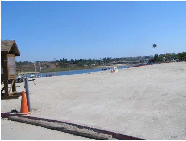
Newport Aquatic Center