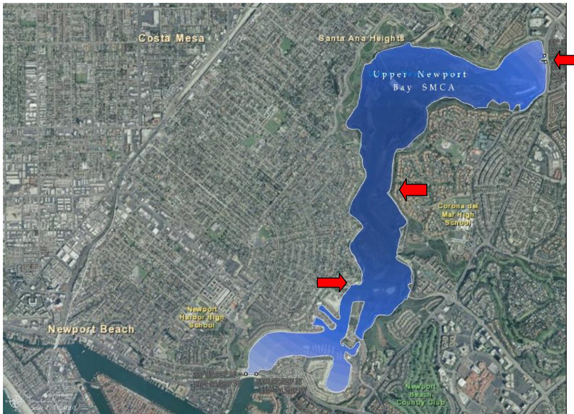
Arrows indicate fishing areas